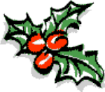
This is a christmas holly.