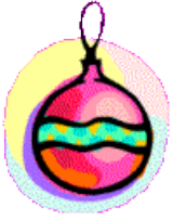
Christmas tree decoration