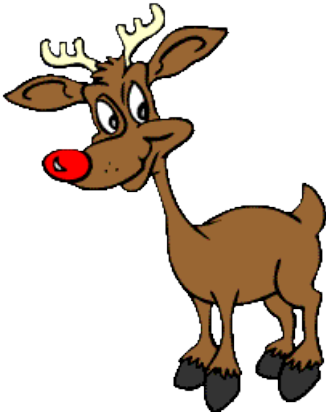
This is Rudolph the red-nosed reindeer.